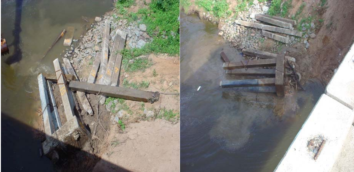
Above photographs were supplied by DOTD and show pieces of bridge at Twelve Mile Bayou removed by Specialized Response Solutions.